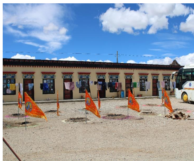
Hotel at Mansarovar