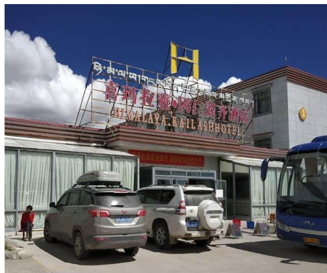
Hotel at Darchen