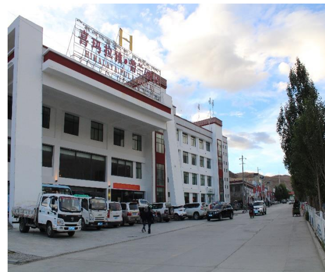
Hotel at Taklakot