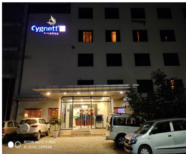
Hotel at Nepal Gunj